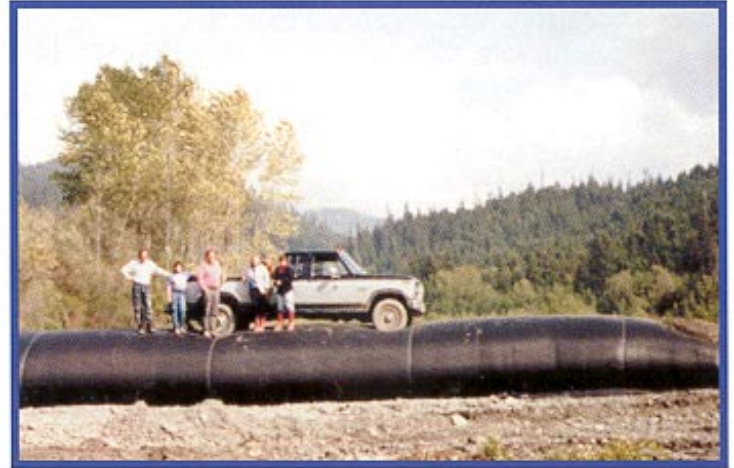
Aquadam™ is strong enough to support a full-size truck!

Faced with temporary water control challenges? Consider Aquadam™ . It's a revolutionary concept that saves valuable time and labor, and best of all it really works. Stream diversions, flood control dams, silt barriers and temporary water storage are a few applications of Aquadam™ , an exciting new method using "water to control water"® Not only is Aquadam™ easy to use, it delivers impressive results at a fraction of the cost involved with sandbagging, sheet piling and earth berms. Just as important, Aquadam™ is light-weight, easy to transport and easy to install.