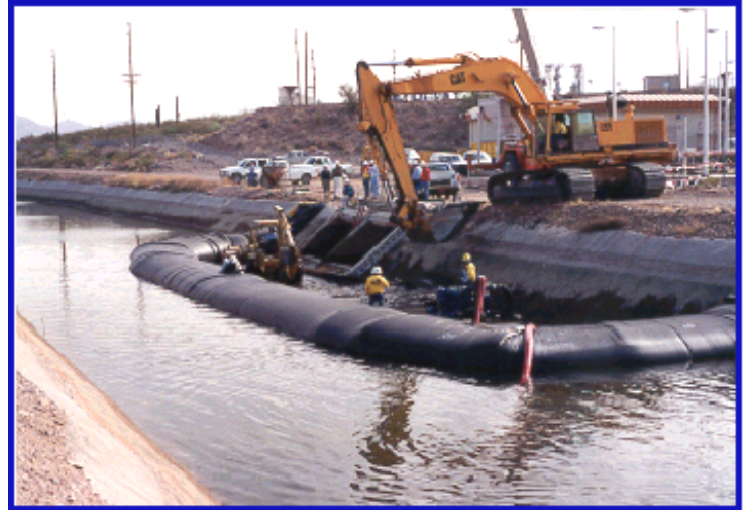
Salt River Canal Project in Phoenix, Arizona.