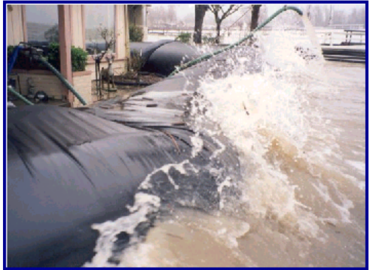
Homeowner flood control in Clearlake, California.