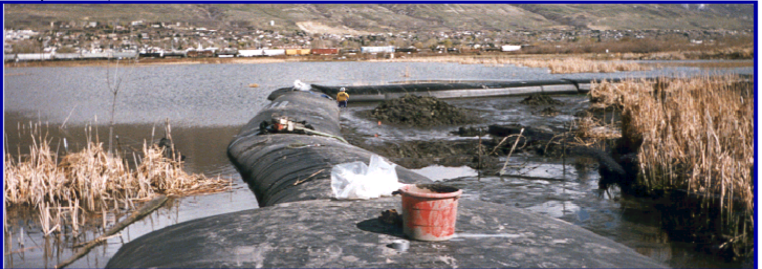
Pipeline repair at The Great Salt Lake, Utah.